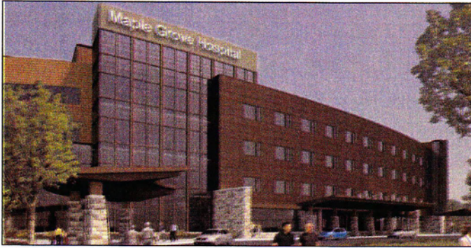
Rendering of new hospital from website: